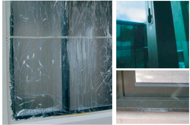
Three of these photographs display damage that has occurred on site, post installation. The photo of the masked joinery on the left displays clear signs of damage that could have occurred were it not masked. Please ensure that your joinery is protected right through the entire construction process.

All the activity on a construction site means that your window joinery or other powder coated items may get knocked or scratched, splattered with mortar, plaster, textured coating or paint during the later stages of construction. Please ensure that all powder coated articles are masked or covered at this time. It is far easier to prevent accidents than to try and correct them. Should your joinery receive mortar or paint splashes see that these are removed before cure and follow the instructions contained in this brochure.