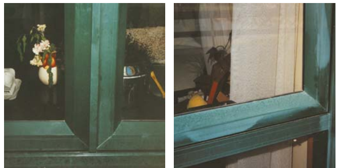
Examples of solvent misuse on aluminium joinery, showing deterioration of powder coating after 3 years.